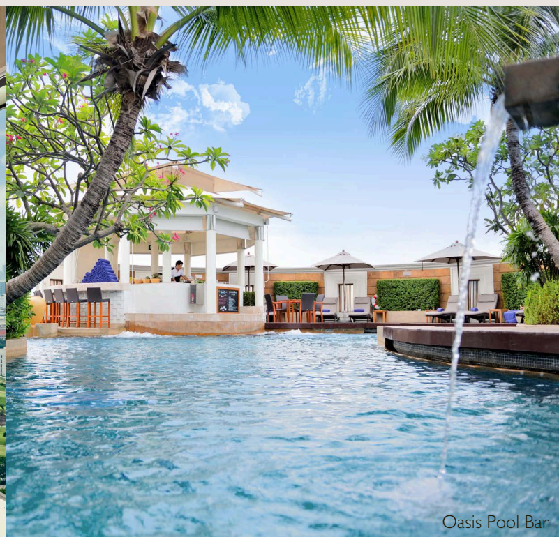
Oasis Pool Bar